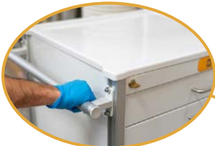
Stable and Ergonomic Grab Handles