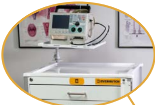
Multiple Configs for Top Accessories