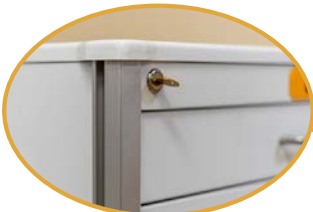
Sturdy Side Rails Have Minimal Areas to Harbor Bacteria