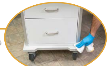
Sanitary and Strong Lower Bumpers