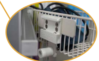
Toolless Accessory Changes Using the Fairfield Rail System