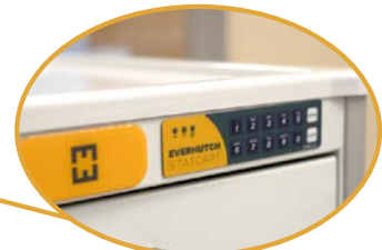
Keyed, RFID, & Electronic Gang Locks