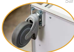
Sturdy, Easy to Clean, Locking Casters