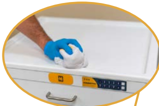
ABS Acrylic, Scratch Resistant, Easy Clean Top with Spill Edge. UV Protection to Prevent Yellowing.