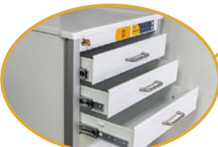
Multiple Depths of Drawers with Split and Single Trays