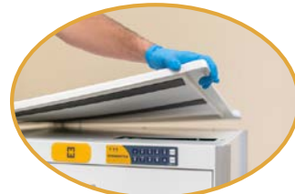
Easily Accessible Batteries and Lock Upgrades